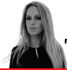
nora en pure